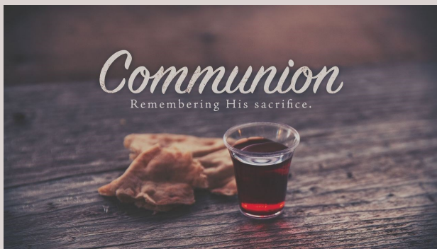
Communion Sunday, July 25th

This will be a day to celebrate God's love and mercy through Jesus Christ. It will also be a time for us to recommit and rededicate our lives to God. Come prayerfully and sincerely to deepen our faith and trust in Jesus Christ.